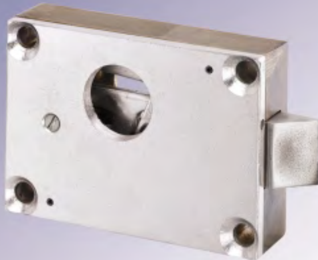
9017 (shown without cylinder)