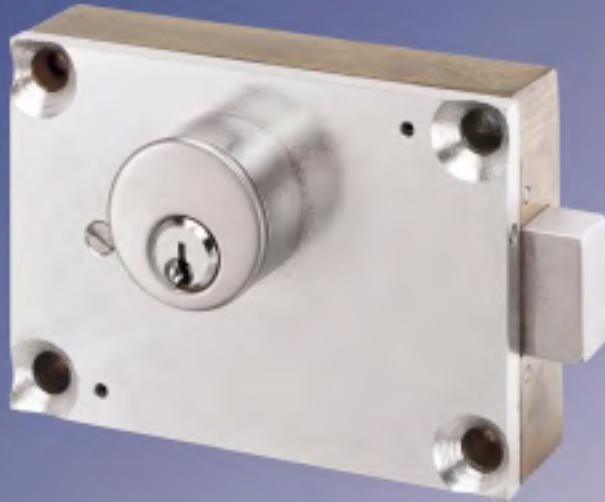
9010 (shown with standard mortise cylinder)

9025 Automatic deadlocking latch fitted for a Mogul cylinder