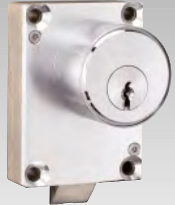
9025 With Mogul Cylinder