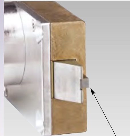
View of 9017/9025 showing auxiliary latch (deadlock trigger).